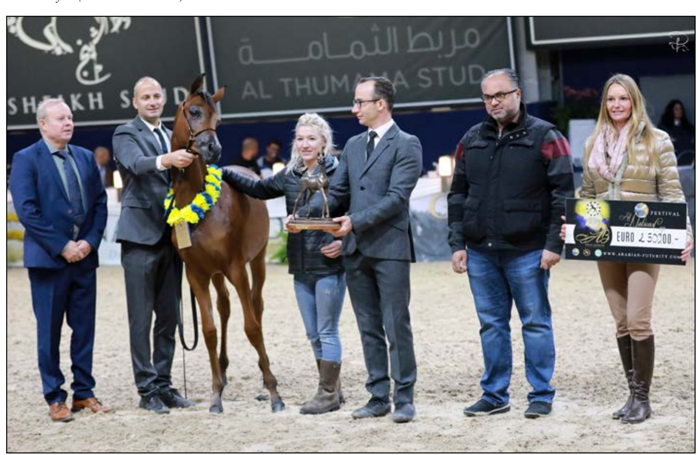
Jameela AM (RFI Farid x Deem AM)