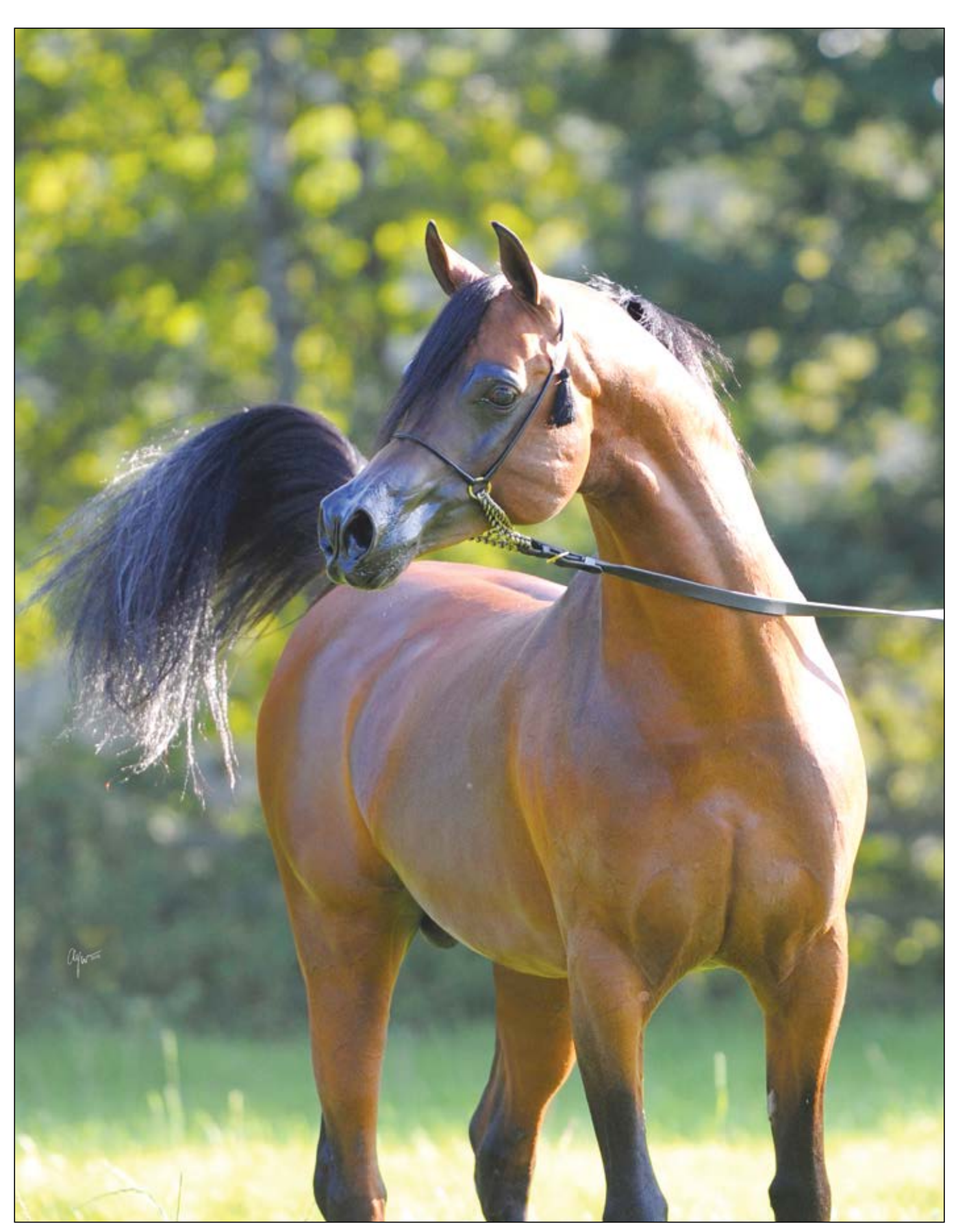
RFI Farid (RFI Maktub x RFI Fayara El Shiraz)