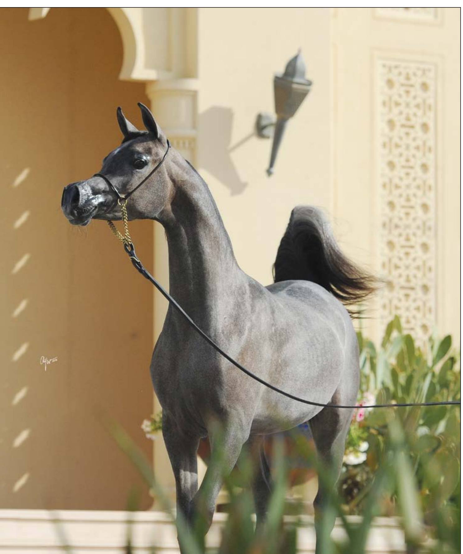
Arabian Stallions (5) of the World XV —